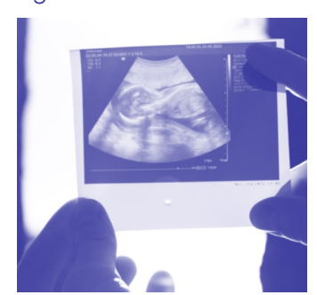
Vote NO on Amendment 3 #MOsaysNO

This November, Missourians must once again stand for LIFE and oppose abortion by voting NO on Amendment 3.